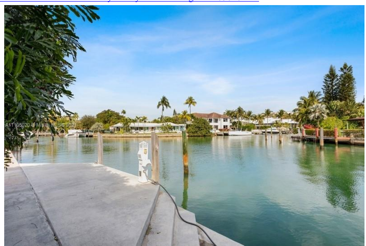
For more information about this listings please visit <a href="http://www.theoceanclub.com/key-biscayne-mls-listing/A11105020.htm">http://www.theoceanclub.com/key-biscayne-mls-listing/A11105020.htm</a>